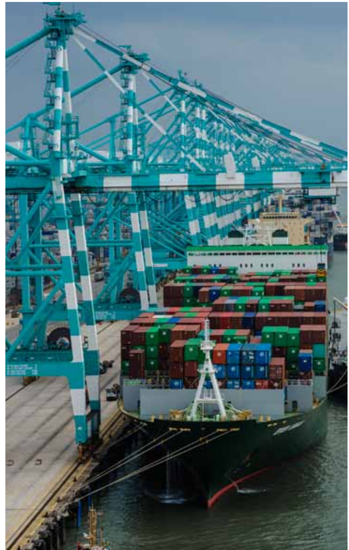
◆◆ West Port, Klang

M & E Services for Office De- velopment On PTB 19155 (Lot 7746-7752 & 7754) At Jalan Bukit Meldrum, Bandar Baru, JB