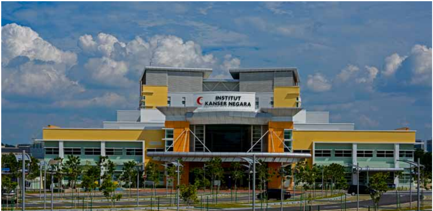
National Cancer Institute