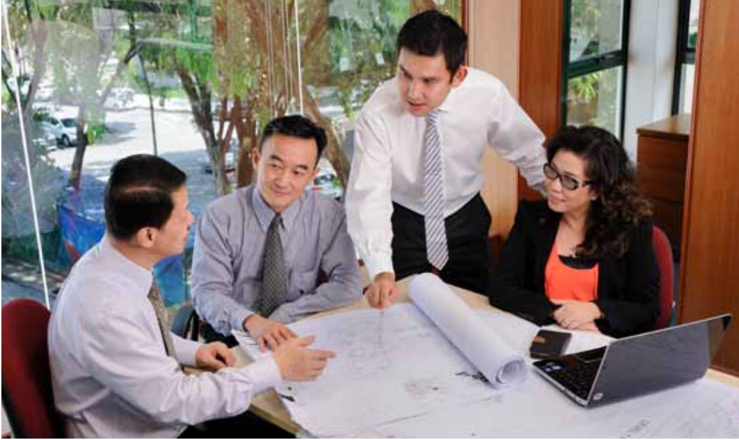
Senior Management Team

City-Lite Letrik Sdn Bhd has assembled a team of trusted and experienced professionals, who provide reliable and essential services