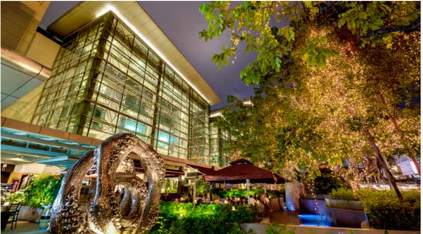
▲ TTDI ▼ Bangsar Shopping Centre