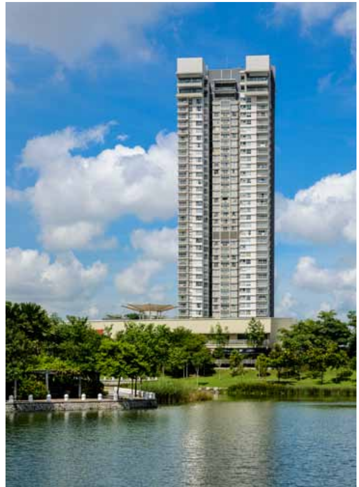
▲ KLIA 2 ▼ Desa Park City